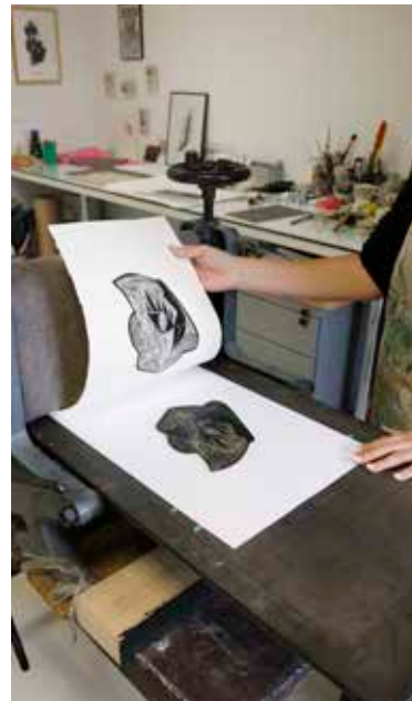
Simili Japon - 975845