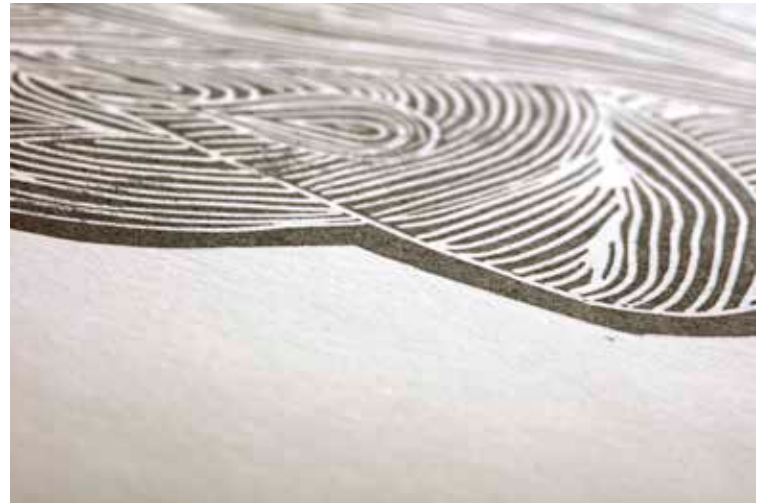
Fleur de Coton - 975055