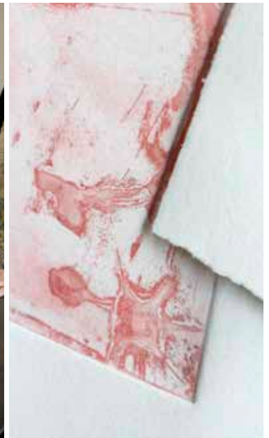
Fleur de Coton - 975055