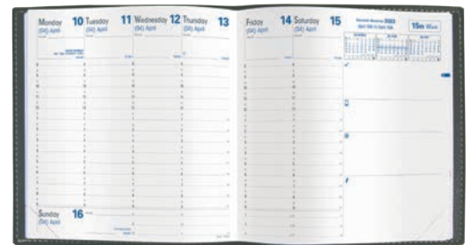
EXECUTIVE - 6 ¼" x 6 ¼" (16 x 16 cm)