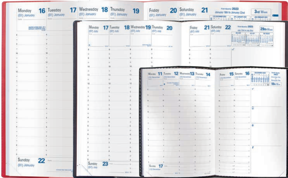
PRESIDENT - 8 ¼" x 10 ½" (21 x 27 cm)

All five weekly vertical planners feature 8am to 9pm schedules, priority boxes, and space for contact information. The President and Executive include receipts and payments pages. The Minister and Visual include monthly pages. The Business is the pocket-sized alternative of the group and features 64g white paper. President, Minister, Executive and Visual planners have sturdy 90g paper, but the one in the Visual is a soft shade of green.