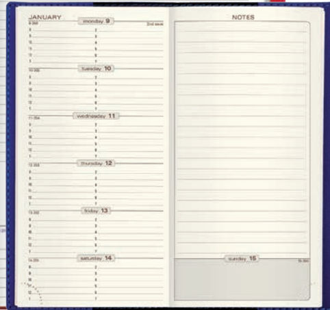
SPACE 17 - 3 1/2" x 6 3/4" (8.8 x 17 cm)